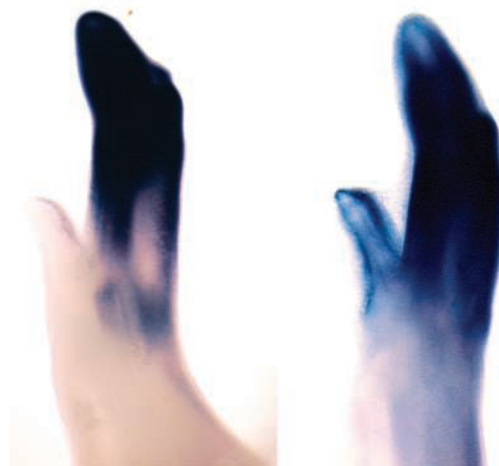
Telltale tracers. The initial digits in developing wings arise where Hoxd13 is expressed (right, dark stain) and Hoxd12 isn't (left, dark stain).